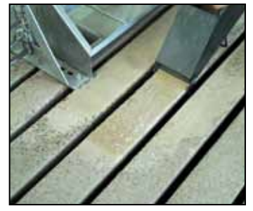
Spread over slats with VSC APPLICATOR