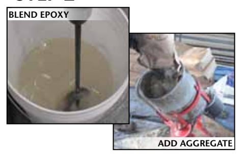
Mix components together