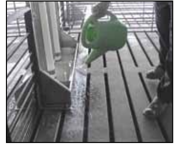
Prepare the surface using VSC CONCRETE CLEAN & ETCH