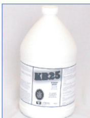
1gal. Jug KB0025