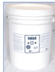
5gal. Pail KB0027